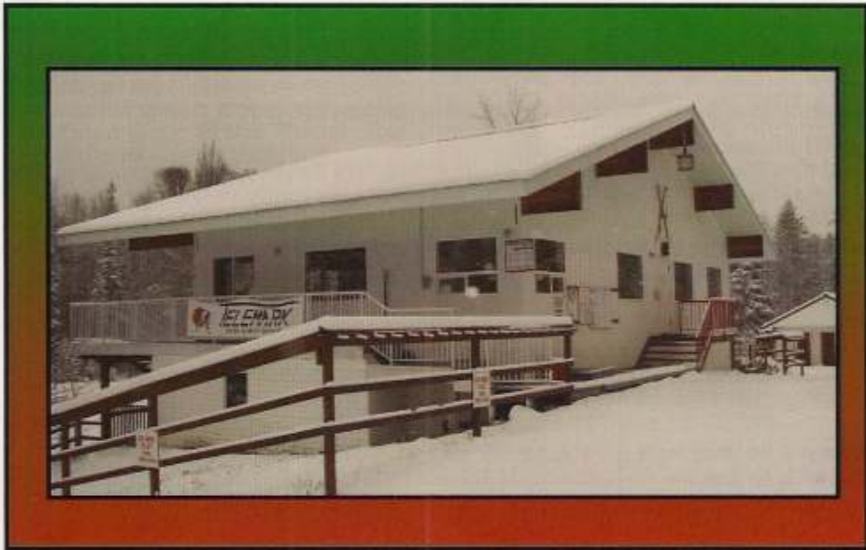
Telemark Cross Country Ski Club before the rush!